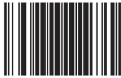
1. Enter Program Mode

To program your scanner, place this page on a flat surface, then scan the following codes in the numbered order.