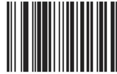
6. Convert Bookland to ISBN