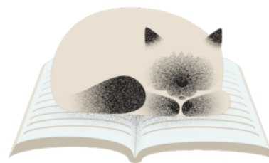
Pasha is ready for winter break—and a long winter's nap!

Learn more about Alexandria's Integrated Email Services , for hassle-free email service, all managed by us. Call 1.800.347.6439 to discuss if this is the best option for your library.